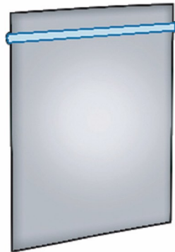
1-GALLON PLASTIC FREEZER BAG