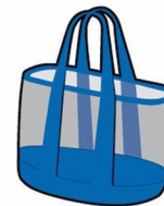
OVERSIZED TOTE BAG