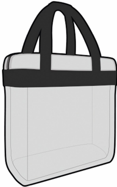
12" X 6" X 12" CLEAR PLASTIC BAG ALLOWABLE STORAGE AREA